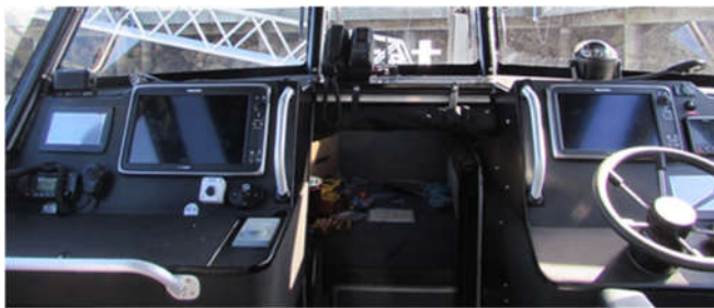
11.3M Naiad Stern Drive